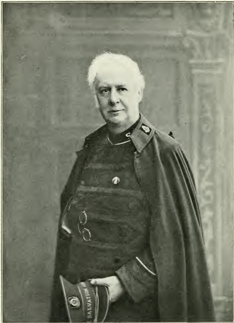
GENERAL BRAMWELL BOOTH